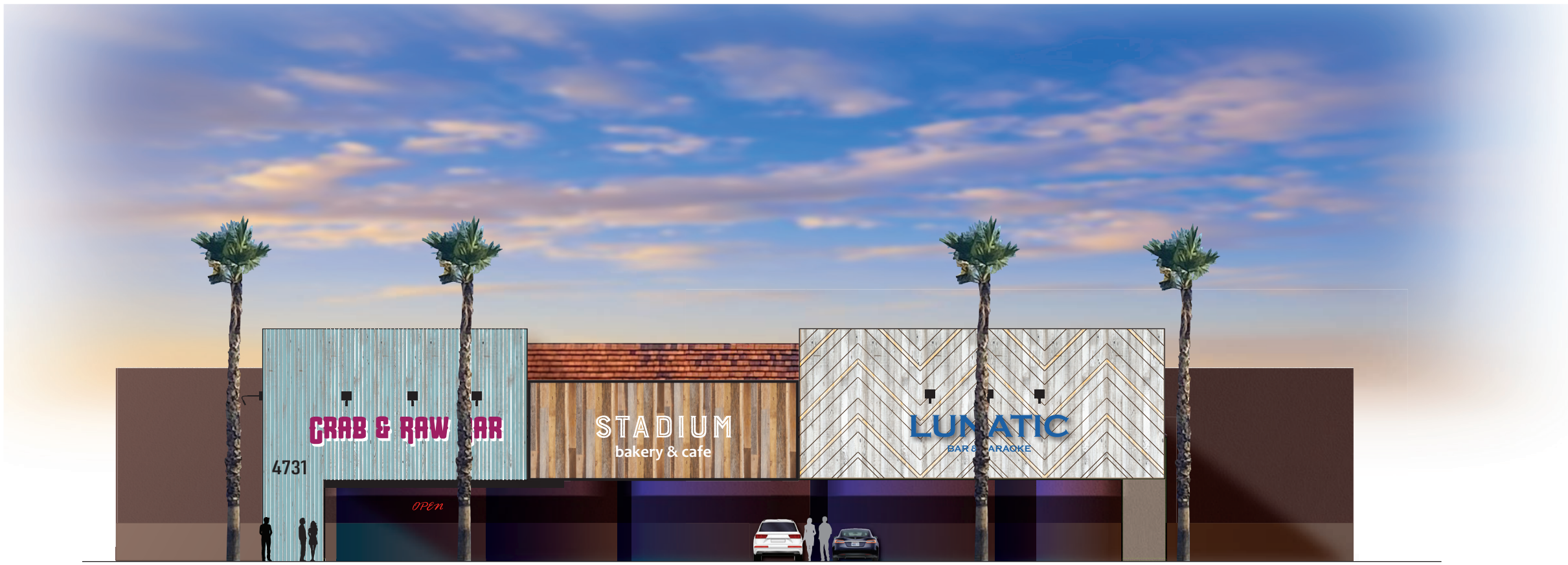
ELEVATION FACADE VIEW CONCEPT -1 VIEW FROM NORTH